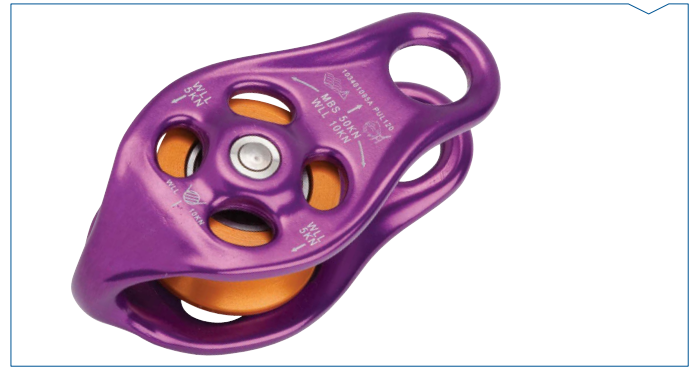
Pinto Rig (Large)