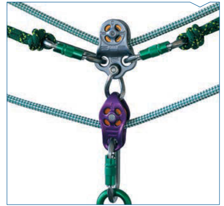
Install a Pinto and spacer on a rope loop to create an adjustable in line anchor when attached with a prusik