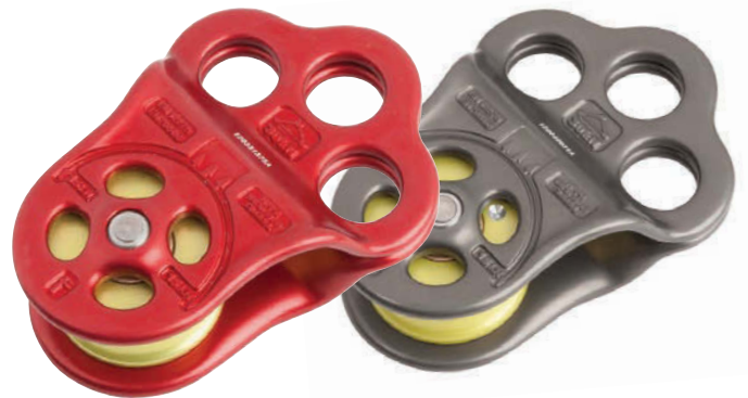
Triple Attachment Pulleys PUL100RD & PUL100BLT