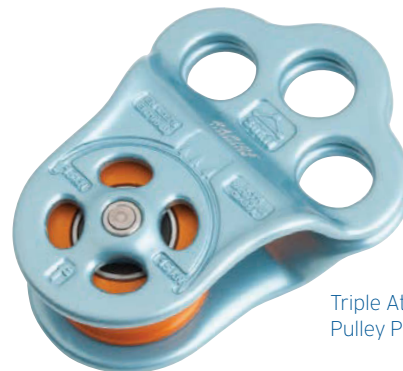
Triple Attachment (Rapide) Pulley PUL100RAPIDE