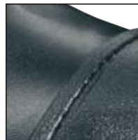
RTC with countersunk seams