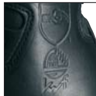
Cut Protection Class 1